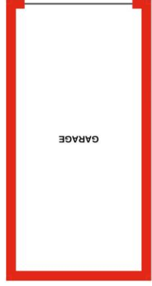
GROUND FLOOR 429 sq. ft. (39.9 sq.m.) approx.

A professional removal company takes the stress out of moving, knowing that your belongings are safe and insured far outweighs any small savings by trying to do it yourself or using a man-and-a-van service. We work closely with and recommend Cube Removals as the leading local firm. For peace of mind and a reliable service call them on 0800 193 0000 or visit their website, cuberemovals.co.uk , to arrange a survey.